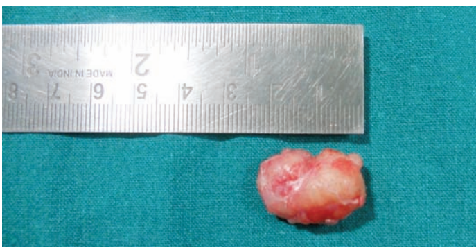
Figure 7: Gross Appearance (2.4 x 1.7 x 1.5 cm) of the Schwannoma After Excision