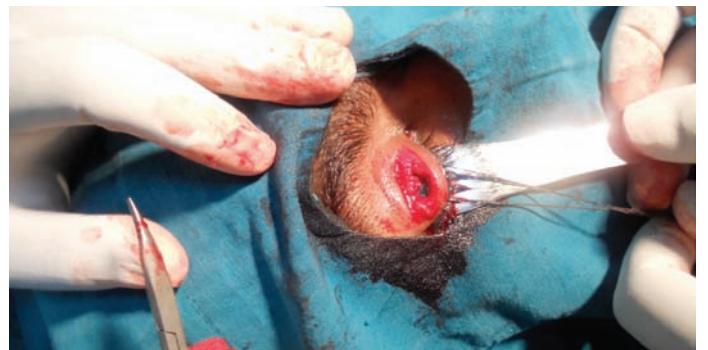
Figure 4: Showing Tarsal Plate Button Holing After Complete Excision of the Schwannoma