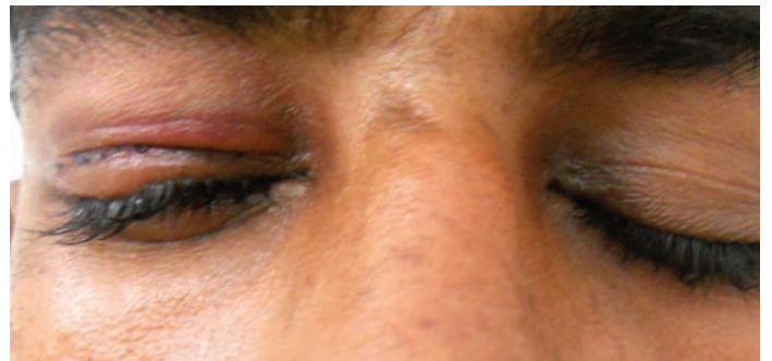
Figure 6: First Post-operative Day Photograph Showing No Lagophthalmos in Right Eye Upper Lid