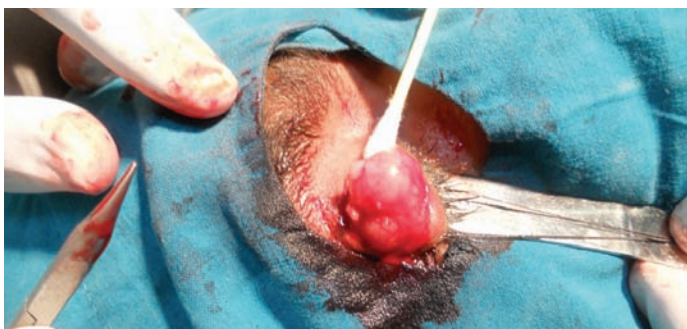
Figure 3: Appearance of the Schwannoma After Dissection from the Surrounding Lid Structures Just Before Excision