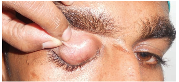
Figure 2: Clinical Appearance of the Right Eye Upper Lid Schwannoma During Examination