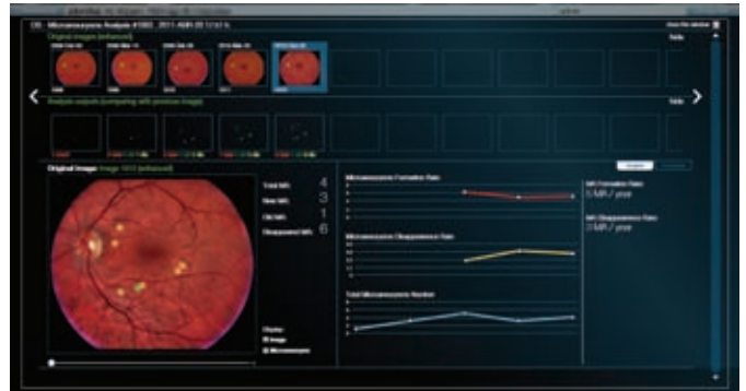
This patient had a microaneurysm (MA) formation rate of 5 MA/year over a 24-month follow-up.

automated comparative analysis software it is now possible to perform reliable sequential comparisons of fundus digital photography images.