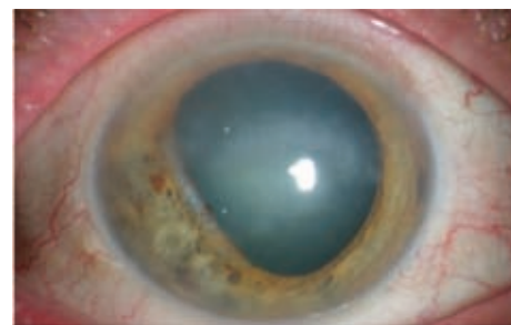
Note residual cornea opacity, fine precipitates and irregular pupil. The aetiology was confirmed by presence of intraocular antibody synthesis.